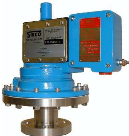
Flanged 2004 Pressure Switch with Single Switch Enclosure

EN 60079-0: 2012 + A11: 2013, EN 60079-1: 2014 Ex II 2 G Ex db IIB + H 2 T6 Gb (Tamb -20°C to +60°C) Certificate Numbers: Basefa02ATEX0025X Basefa02ATEX0025X/1 Basefa02ATEX0025X/2 Basefa02ATEX0025X/3 Certifying Authority: SGS Baseefa Limited