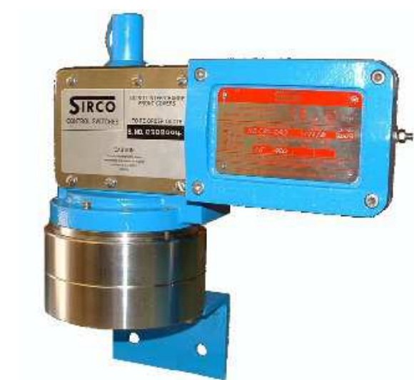
HPN2001 Pressure Switch with Two/Twin Switch Enclosure

Compliant to: EN 60079-0: 2012 + A11: 2013, EN 60079-1: 2014 II 2 G Ex db IIB + H 2 T6 Gb (Tamb -20°C to +60°C) Certificate Numbers: Basefa02ATEX0026X Basefa02ATEX0026X/1 Basefa02ATEX0026X/2 Certifying Authority: SGS Baseefa Limited